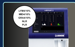
Offering NLR, PLR