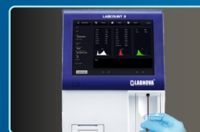
Small sample volume