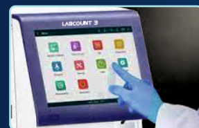
Intuitive operating system